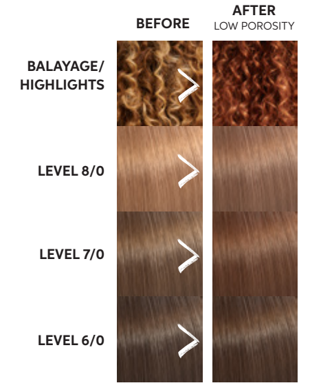
RESULTS NOT NOTICEABLE ON DARKER LEVELS

Suggested shade directions: /7, /35, /73