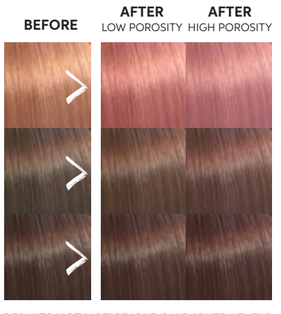
RESULTS NOT NOTICEABLE ON DARKER LEVELS